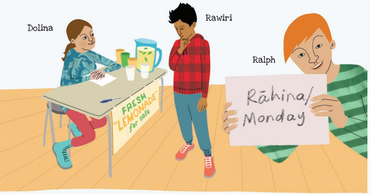
Scene 1. DOLINA is at her lemonade stand. She has glasses, a jug of lemonade, a pen, some paper, and a sign: Fresh "lemonade" for sale. RALPH enters and holds up his own sign: Rāhina/Monday. He gives the thumbs-up to the audience, then sits in a chair at the side of the stage. RAWIRI enters.

DOLINA . Roll up, roll up! Fresh lemonade for sale.